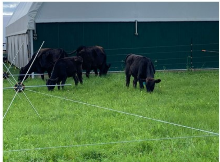
Rotational grazing in action.