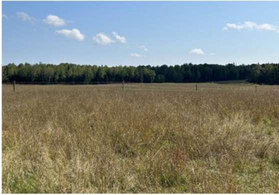
The Thunder Bay Community Pasture.